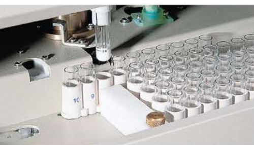
The 4C3's specially-designed cassettes move samples into position for automatic testing.