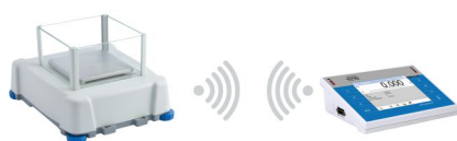
Additionally option: PS xx.3Y.B

Balances PS 3Y series are laboratory weighing instruments featuring 5,7" LCD colour touch panel which provides new possibilities of balance operation and presenting measurement results.