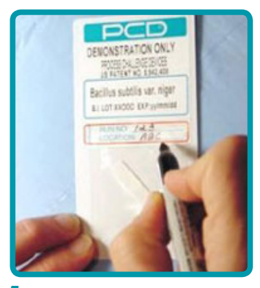
Write appropriate cycle number and BI Location on PCD label.