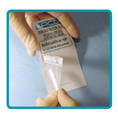
5 Remove BI pouch and location ID label together by tearing off at perforation.

4 After EO processing, remove all PCDs and return to Microbiology Laboratory.