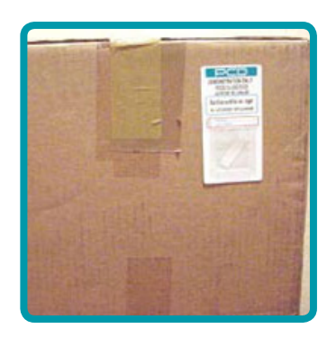
3 Affix PCD to the outside of an appropriate box in a specified load location.

4 After EO processing, remove all PCDs and return to Microbiology Laboratory.