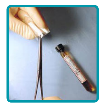
7 Using aseptic technique, cut the pouch open and remove Biological Indicator.