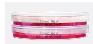
labelling on the sides of Petri dishes