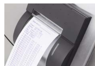
Systec Mediaprep printer for documentation