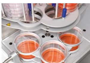
Systec Mediafill with Petri dishes