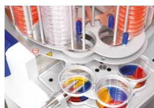
Systec Mediafill with Tri-Plates